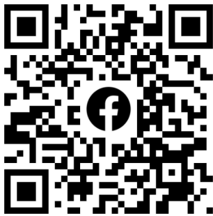
QR Code for Facebook Group